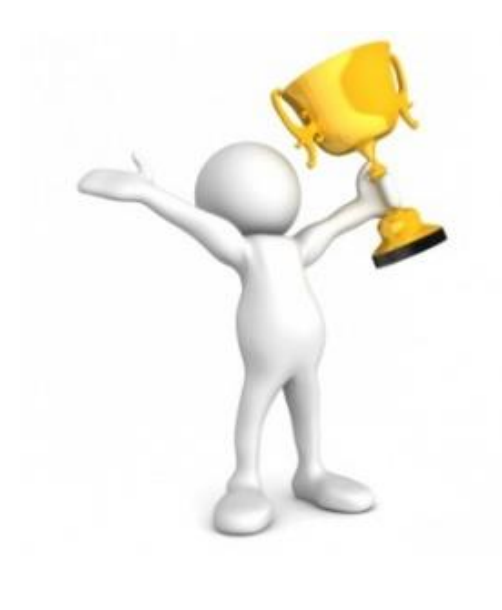
Think like a winner and you will become a winner.

Click here to sign up or for more information.